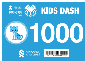
BLUE CHEETAH 0 – 3 YRS OLD

The animal pictograms indicated on the bib refers to the child's age group and start pen.