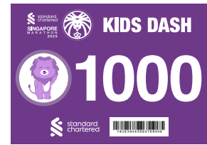
PURPLE LION 10 – 12 YRS OLD