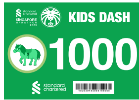
GREEN HORSE 4 – 6 YRS OLD