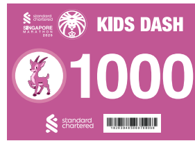
PINK GAZELLE 7 – 9 YRS OLD